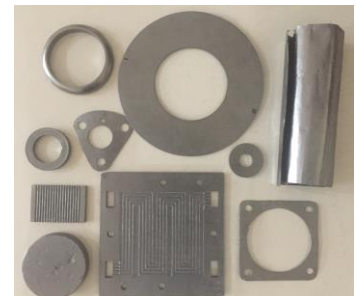
Digital photograph of EG based material compacted in various shapes