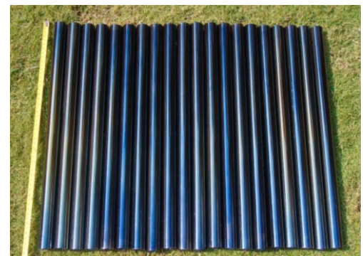
0.5-meter tandem absorber