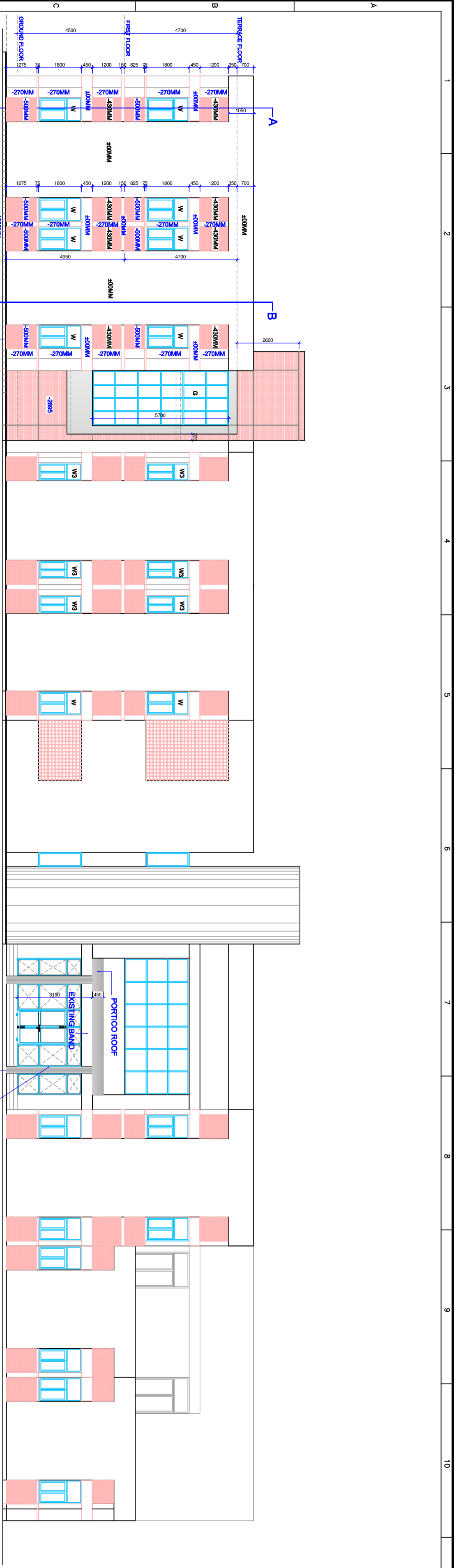
EAST SIDE ELEVATION